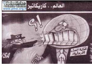
[ Al-Ayyam , Feb. 27, 2004]