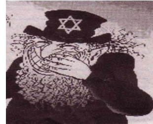
[ Al-Ayyam , April 5, 2003]

This dehumanization of Jews plays a role in preparing PA society to be willing to kill Jews (see Stage 3 below.) Animals are clearly inferior to humans, and in many societies have no rights, are used for experiments and routinely hunted.