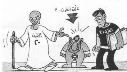
“Disease of the century” [ Al-Hayat Al-Jadida (Fatah), Dec. 28, 1999]